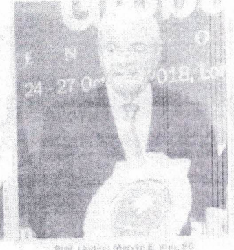
Prof. (Judge) Mervyn E. King, SOA, Chairman of the Jury, Institute of Directors, London, UK, 2011.

Golden Peacock Awards, instituted by the Institute of Directors (IOD), India in 1991, are now regarded as a benchmark of Corporate Excellence worldwide.