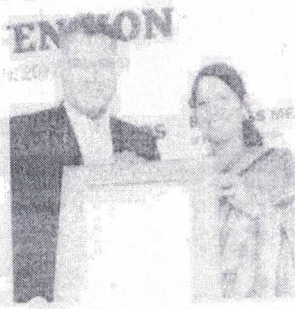
The Rt Hon. Sir Ashok Kumar ACMS MP, Minister, Government of India, 2011. The Rt. Hon. P. V. Narasimha Murthy MP, Union Cabinet Minister, 2011. The Hon. P. V. Narasimha Murthy MP, Union Cabinet Minister, 2011. The Hon. P. V. Narasimha Murthy MP, Union Cabinet Minister, 2011.